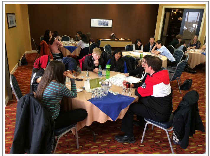
Students in group activity on Taking Action