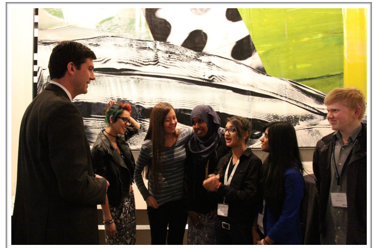
Students @ ZERO2014 Conference meeting Mayor Iveson