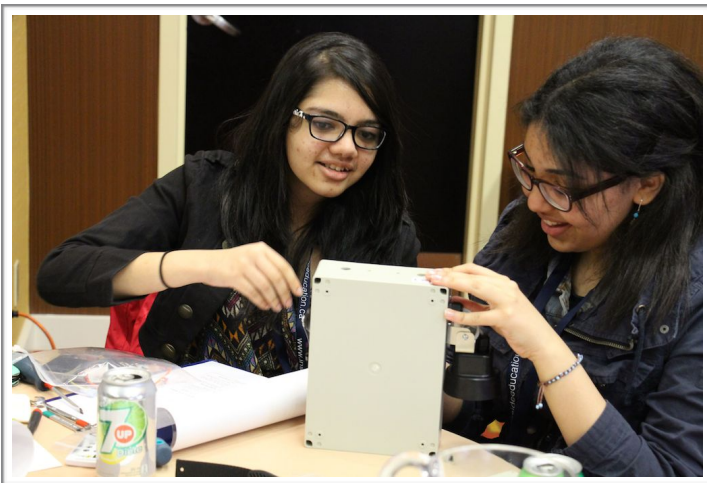
Students building solar lanterns to be sent to Africa