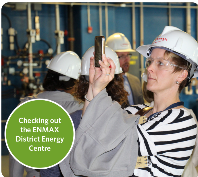
Checking out the ENMAX District Energy Centre

A special thank you to the following groups for providing tours and expertise