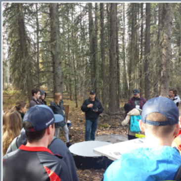
Field tour at the Evergreen Centre for Resource Excellence and Innovation

The 2015 Alberta Boreal Careers Project - Grande Prairie was a success from the initial promotions to the final evaluations. Inside Education announced the program online and received numerous high quality applications from schools across the province. We had an equally positive response from local professionals eager to share their career stories; indicating a demand for this type of programming in Northwestern Alberta. During the program anecdotal evidence shared by teachers, students and experts alike affirmed that experiential careers programming is an ideal way to make meaningful connections to local opportunities. Following the program we encouraged teachers and students to share their thoughts about the program: