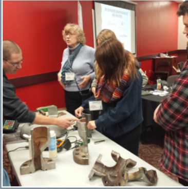
Learning together during the career roundtables