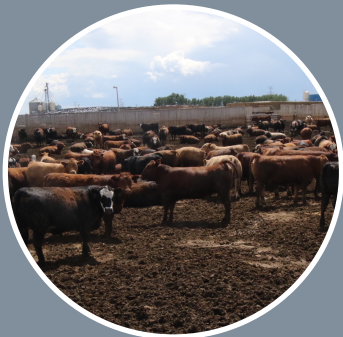
Meeting the livestock at Chinook Feeders