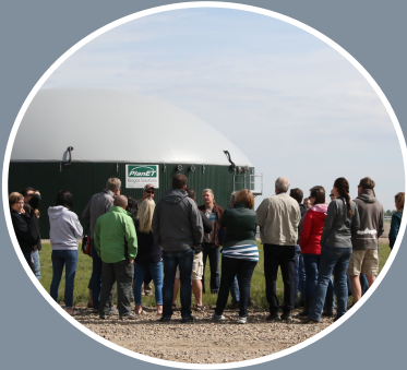
Farming energy - Learning about biodiesel at Perry Farms