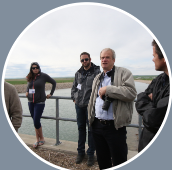
Exploring irrigation canals with the Alberta Irrigation Projects Association the Raymond Irrigation District

The 2016 Agriculture in Alberta Program attracted many high quality applications from which Inside Education invited 26 highly engaged teachers with varying level of experience incorporating agricultural topics into the classroom. As this was the first program of its kind offered by Inside Education, we can only expect that demand will grow as the success of the program is shared through education networks.