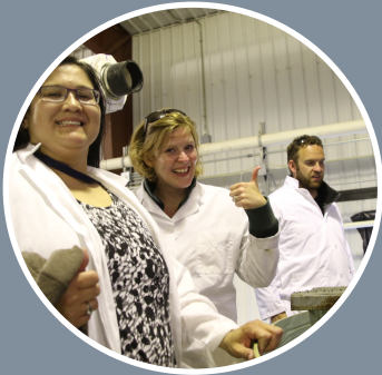
Aquaculture tour at Lethbridge College

100% of survey respondents agree that the program was a a good networking opportunity and a high quality professional development opportunity.