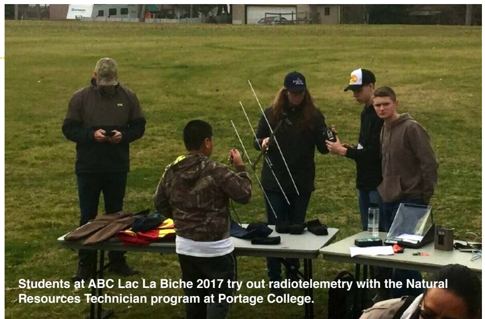
Students at ABC Lac La Biche 2017 try out radiotelemetry with the Natural Resources Technician program at Portage College.

Careers in natural resources in the boreal region of Alberta are one of the ways in which students can choose to show lifetime environmental stewardship. By learning about the local career opportunities and the strong ties between their own communities and Alberta's natural resources, students are able to develop their career path from an informed and conscientious perspective. The program was so successful that the next ABC Project will take place in Spring 2018 in yet another boreal community in Alberta!