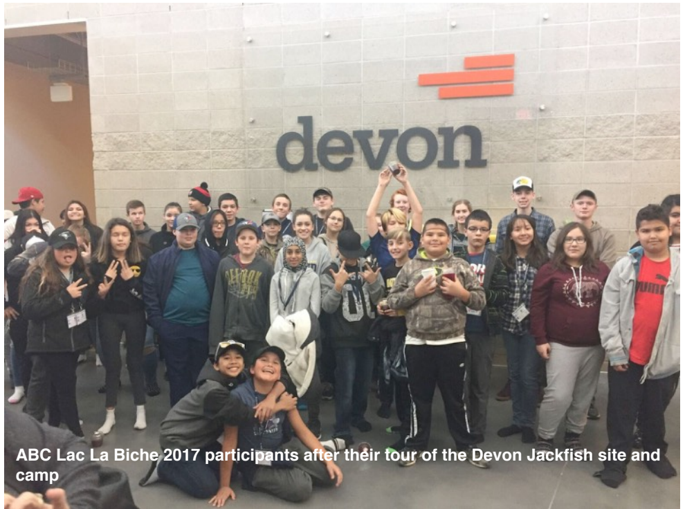
ABC Lac La Biche 2017 participants after their tour of the Devon Jackfish site and camp