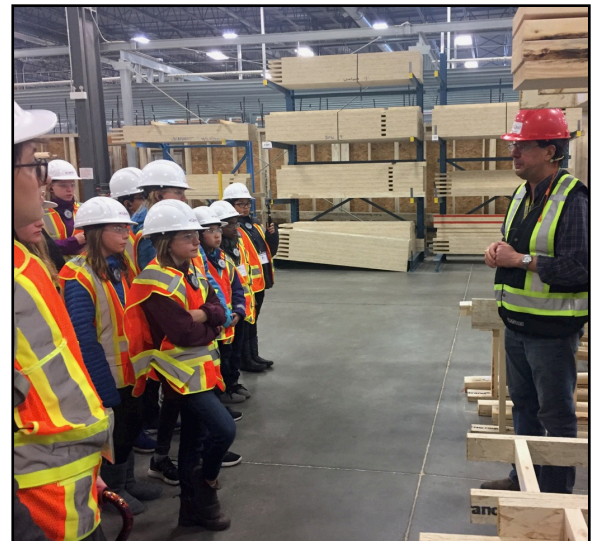
Students touring the ACQBuilt Facility

Expert presentations included formal keynote speeches and smaller breakout discussion where students had the opportunity to interact with ten energy efficiency experts. E3 concluded with an interactive workshop, with help from attending teachers, to help synthesize and critically assess students questions formed over the two-day summit.