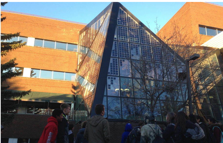
Students at E3 admire and are inspired by innovative design like these solar panels, distributed to account for shade from the local trees.

We are happy with the successes of E3. Using feedback from previous years, we continue to refine our approach to offer the highest impact education programs and look forward to continuing to offer energy education youth summits in the capital city!