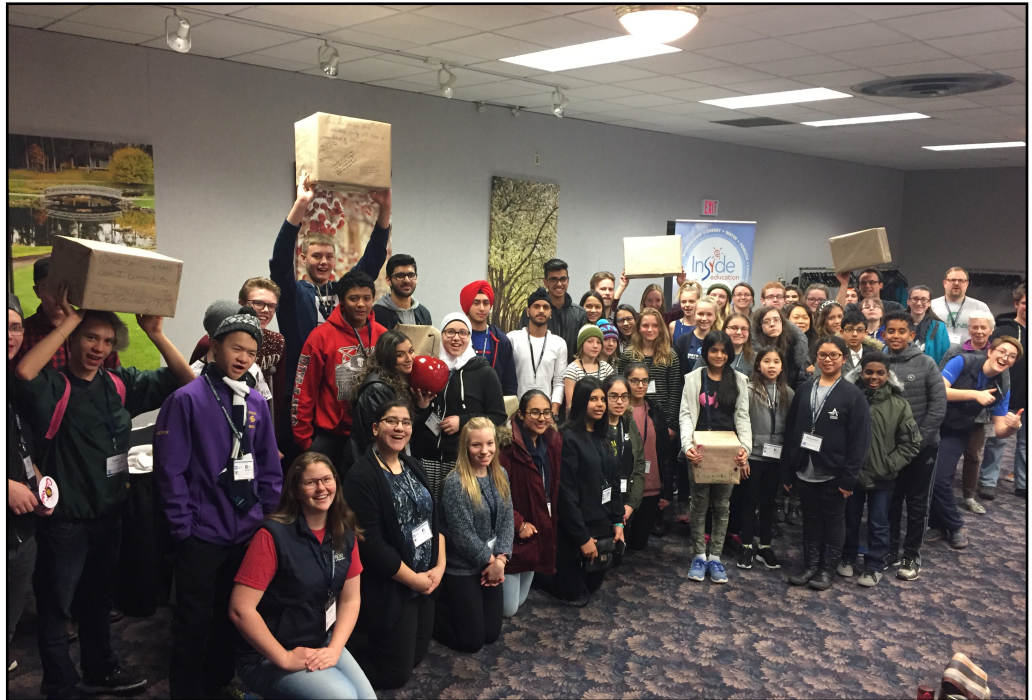
E3 participants finishing off the E3 with lots of new ideas!

The program was piloted in 2012 under the name Generate Edmonton, and held in 2014 under the name Energize: Youth Energy Symposium (EYES), and in 2015 as Edmonton Energy Efficiency (E3) Education Program.