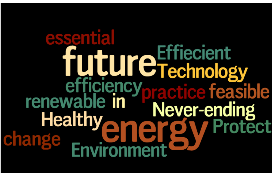
Top 3 words from respondents that come to mind when thinking of "sustainability"

100% of respondents have ideas for leadership projects to take back to their school