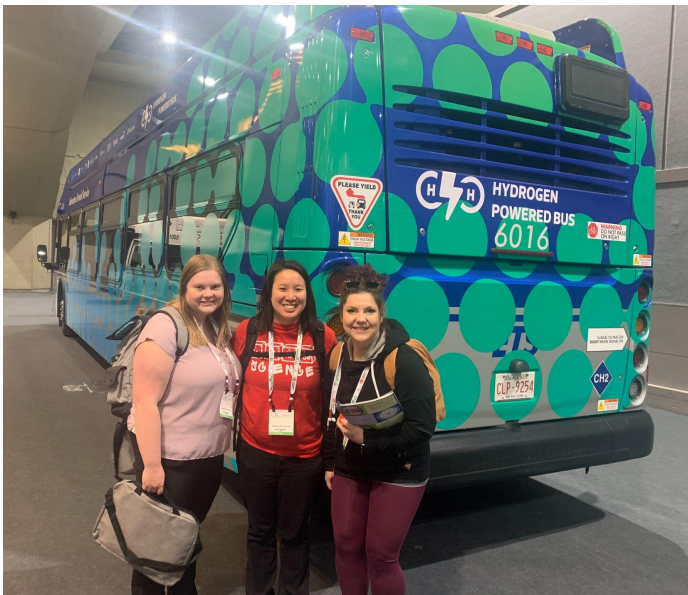
Canadian Hydrogen Convention

Following a program welcome and introduction, teachers participated in two tours in the Edmonton area. In the first tour, teachers were free to roam around the Canadian Hydrogen Convention Exhibition Hall to learn from industry professionals about hydrogen's role in Alberta's Energy Landscape. In the afternoon, teachers then headed to Pembina Pipeline Corporation in Sherwood Park to learn more about careers in energy, tour Pembina's control room, and participate in an interactive pipeline and fractional distillation demonstration. Following the tours, the program ended at NAIT with an in-depth workshop of the Energy Education Toolkit.