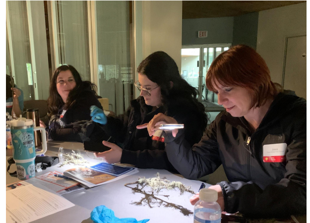
Environmental Assessment with WBEA

*Participants: 9 teachers from Fort McMurray and Timberlea