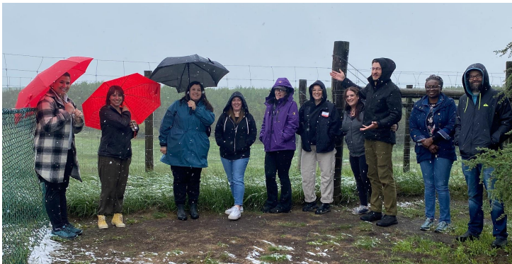
Mildred Lake & Bison Paddock

*Participants: 9 teachers from Fort McMurray and Timberlea