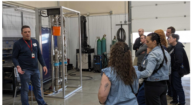
Fractional Distillation Demonstration, Pembina Pipeline Corporation