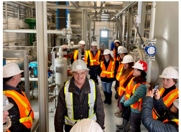
Alberta Carbon Conversion Technology Center

“This is one of the best professional learning opportunities teachers can do to help bring the curriculum objectives to life. I love the hands on components, the tours, the experts...it was very inspiring! I would highly recommend Inside Education programming to any teacher!”