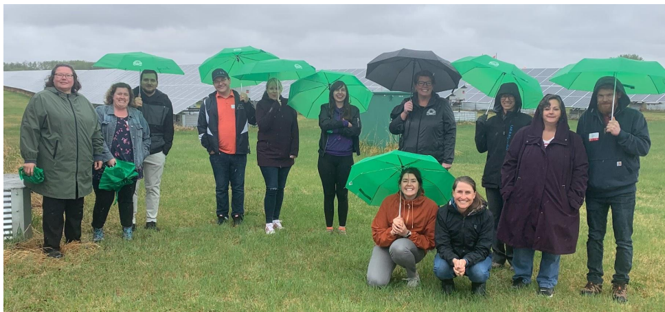
Sexsmith Solar Farm